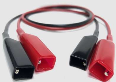
Insulated Alligator Clip, 18 AWG PVC 12 inch Test Lead Jumper. Alligator clips max jaw opening 0.31 in (7.92 mm).