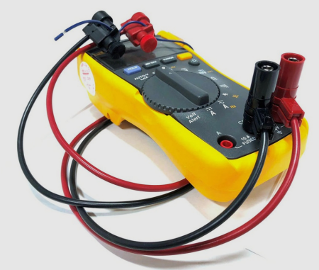
Banana plugs fit into multimeters for diagnostic testing and measurements