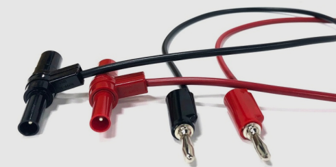
Stacking Banana Plug to Stacking Shrouded Right-Angle Banana Plug Test Lead, 18 AWG PVC 18 inches